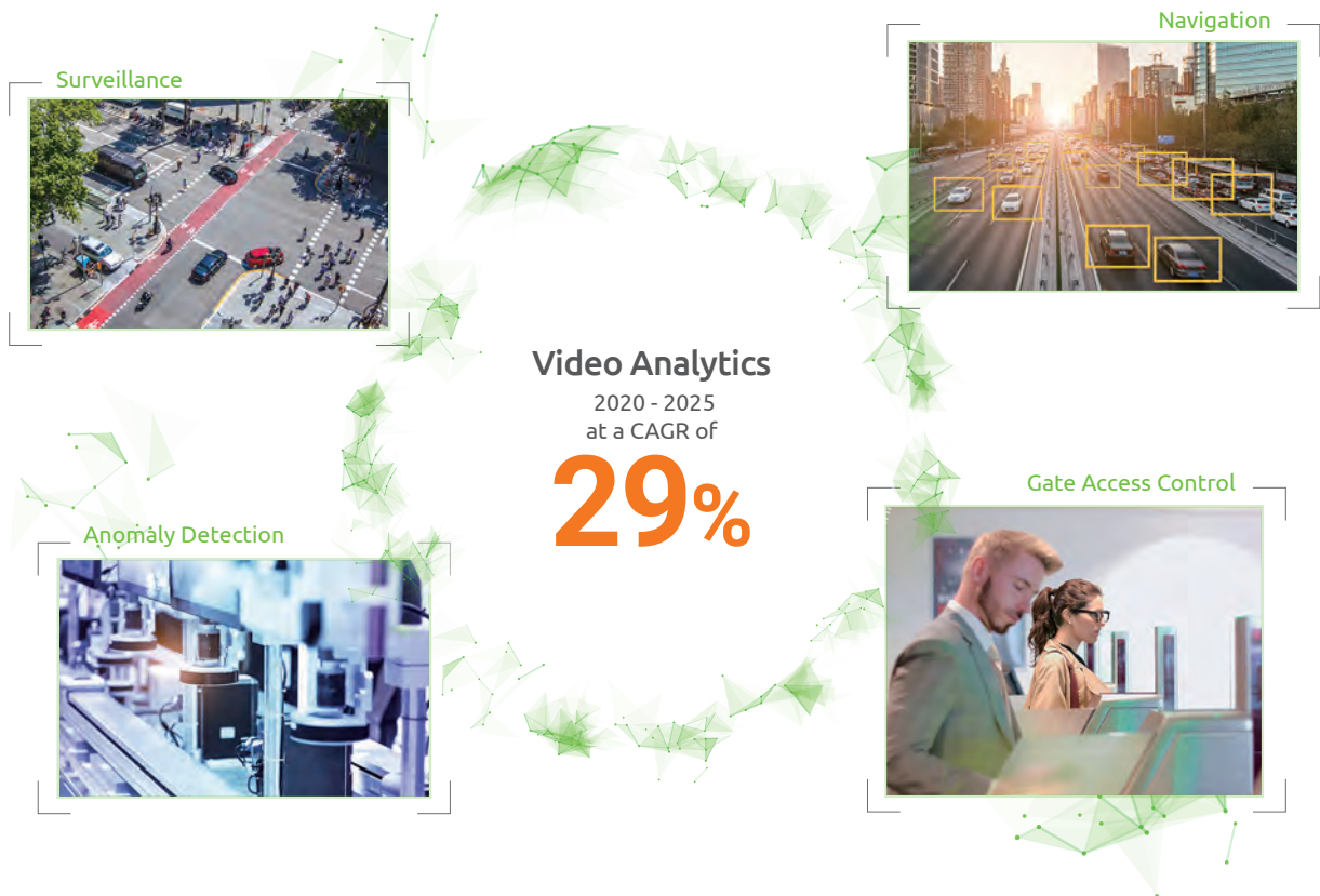
Figure 1. Industries are employing video analytics to extract actionable information.

As a result, EVA minimizes latency and does not need a persistent network connection, making it suitable for both mobile and stationary deployments. EVA also alleviates privacy and security concerns over confidential data.