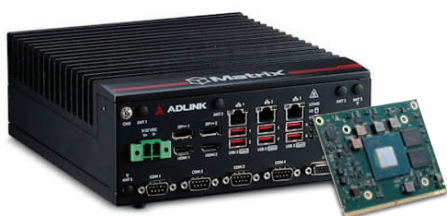
Figure 2. The ADLINK MVP-5200-MXM computer and MXM-AXe GPU module.

Hyper Compute, which is part of Intel Deep Link technology, intelligently balances compute workloads across CPU and GPU resources. This underlying mechanism enables applications to harness availability and maximize utilization of Intel hardware capabilities to speed up computations. Similarly, the Intel® OpenVINO™ inference engine is capable of combining CPU, integrated GPU, and discrete GPU resources available on an Intel platform such as the ADLINK MVP-5200 series computer to support AI workloads. The OpenVINO solution stack features an open, non-proprietary programming model and draws on the unmatched Intel ecosystem of hardware and software building blocks.