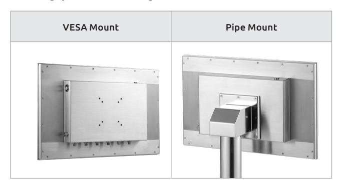
Figure 2. ADLINK Titan Panel Computer Series Mounting Systems

OEMs, ODMs, and systems integrators can choose one of the two mounting systems shown in Figure 2: