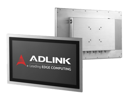
Table 1 lists the key features of the ADLINK Titan Panel Computer series. The modular design of these panel computers also allows for customizable I/O and functionality. Contact your ADLINK representative for more information.